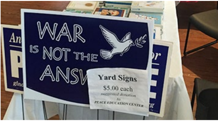
PHOTO: PEC distribution of yard signs and United Nations holiday cards at the annual Alternative Holiday sale is both a fund-raiser and a way to send a message of peace.

Saturday April 15 & 16 • 14th Annual Keep Making Peace Conference: Locked in, Locked up, Locked out. Mass incarceration and inequality - University United Methodist Church, 1120 Harrison Rd. EL, 9am-4pm.