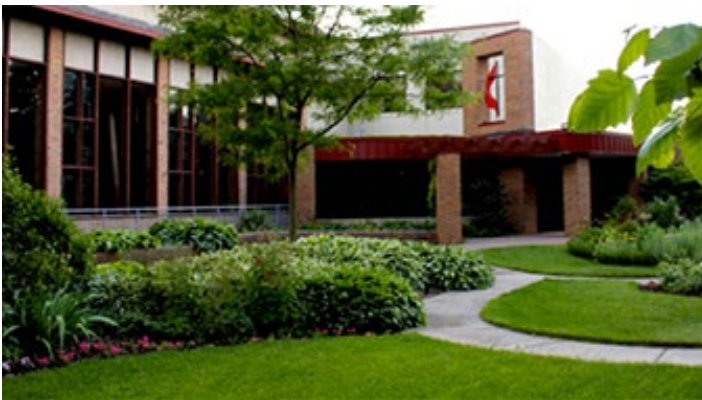
Our new (and old) home at the University United Methodist Church in East Lansing

The Peace Education Center's office is moving back to the University United Methodist Church, 1120 S. Harrison Rd., where it was located years ago. Much of our center's historical material has been donated to the Special Collections of the Michigan State University; we've been adding more as we prepare to move.